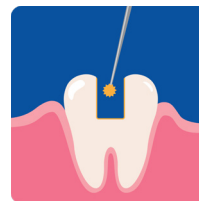
3. Apply adhesive system of choice. Follow manufacturer instructions.