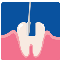
1. Prepare cavity.