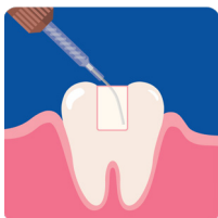
4. Bulk fill with ACTIVA™ BioACTIVE Bulk Flow™.